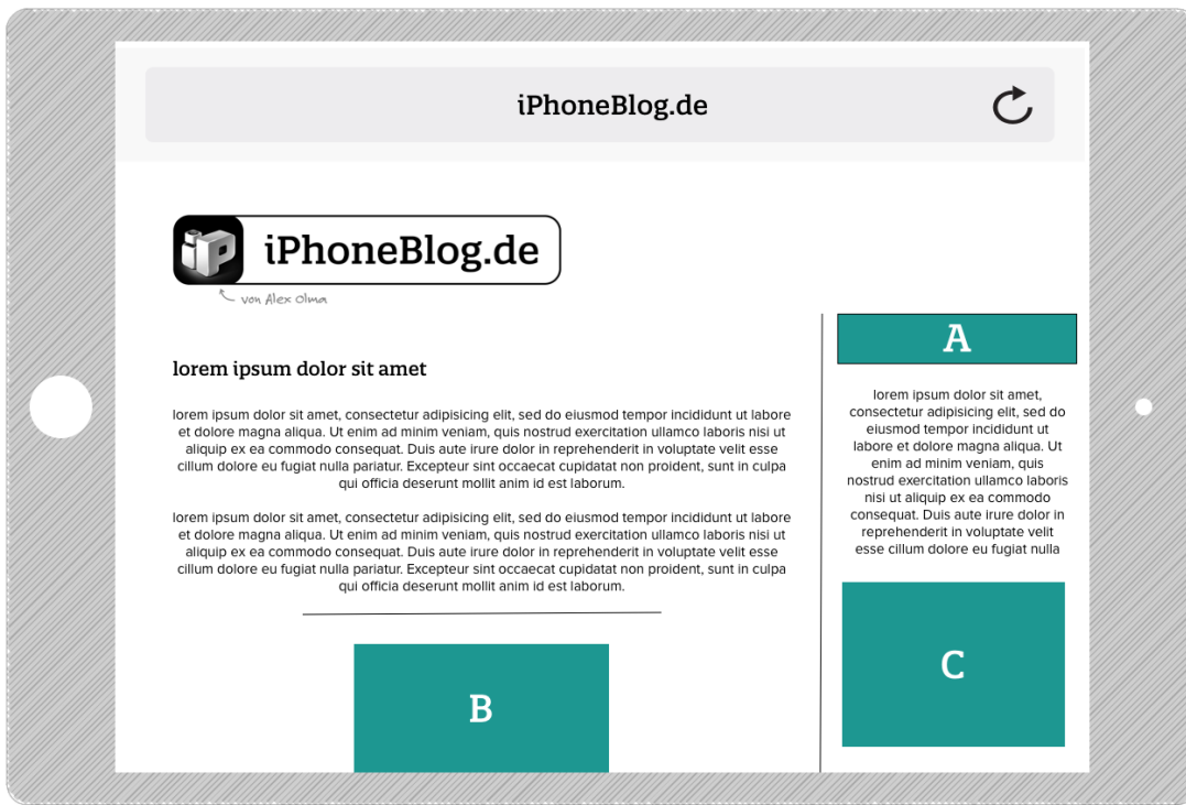
iPad widescreen / Desktop Webbrowser